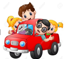
Ministry Schedule for next week (Mar 23/24)

Why do you think that Jesus tells us the seed must die before it can grow? The seed has died when it is under the soil, and a little plant comes to birth. If the seed has died, is it finished?