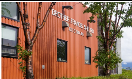
BROTHER FRANCIS SHELTER